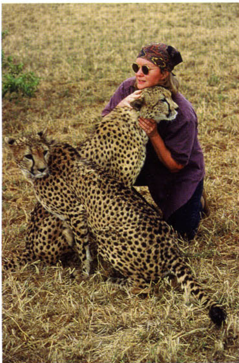
The most magic moment of my life with two cheetahs.

I felt a bit silly examining poo, but a necessary knowledge of being a wildlife photographer. Broken branches and leaves are also important. The elegant Gerenuk always stand up to eat, so when I see a tree with the leaves nibbled at one level, I know gerenuk are in the area.