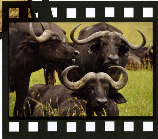
Right: Three menacing buffalos - they are very dangerous.

And sound is also important. Animals will react if a predator is close. Impalas point in the direction of the hunter and make a barking sound and monkeys give a warning screech. Elephants have different sounds for their moods – from a gentle rumble to a loud trumpeting. I had my first frightening experience when a 6 tonne bull elephant charged the jeep. But, it was only a mock charge and I felt safe with my African guide.