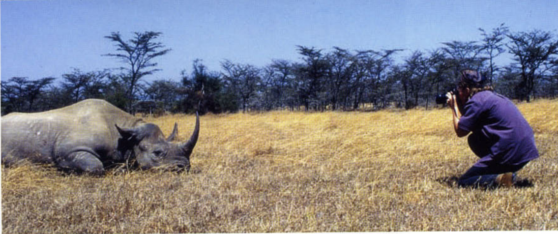
I'm nervously crawling up to photograph a rhino.

If you want to become a photographer learn technique first. Get to know your camera and experiment with light, design and cropping. Research the 'subject' to be photographed. Google photographic schools and institutes for information.