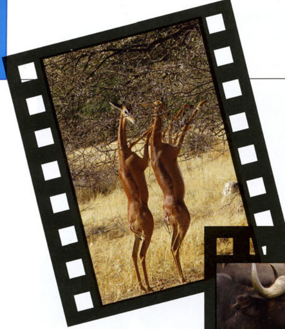
Above: Gerenuk always stand up to eat.